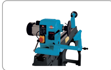
Head rotation up to 180°