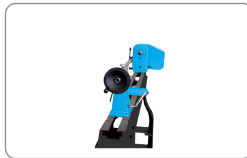
Headstock and tailstock drilled at 10 mm