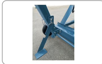
Interlocked top guard and log carriage