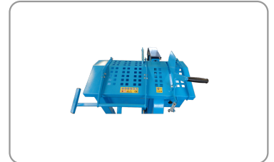
Protecteur supérieur avec poignée réglable et griffe de maintien de la bûche