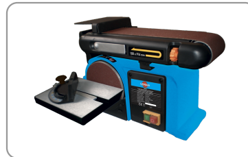
Cast aluminium table tilting at 45°