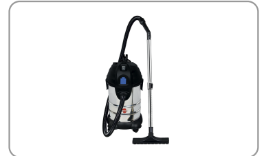
Prise de synchronisation pour machine électroportative maxi 1800w