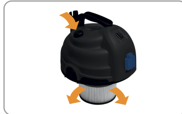
Manual unclogging of the filter by push & clean function