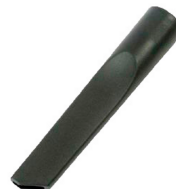
Straight crevice nozzle