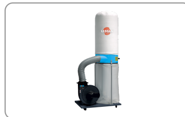
Felt filter bag