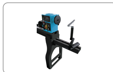
Extension and external tool rest