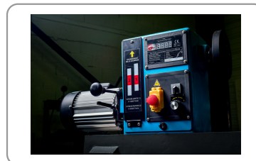
Electronic speed controller