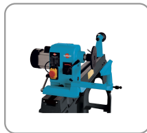
Head rotation up to 180°