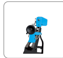
Headstock and tailstock drilled at 10 mm