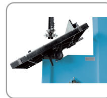
Table tilting at 45°