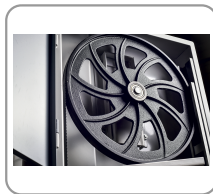
Balanced cast iron flywheels