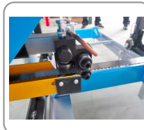
Guide et protecteur de la lame réglable