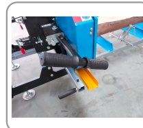
Adjustment handle for blade tension