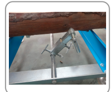
Système de maintien de grume