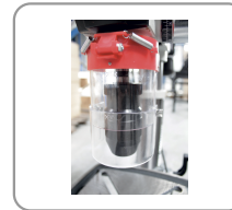
Adjustable chuck guard