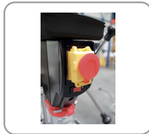
Emergency stop push-button