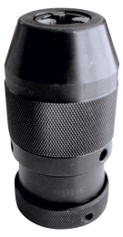
Keyless chuck B18 1-16 mm