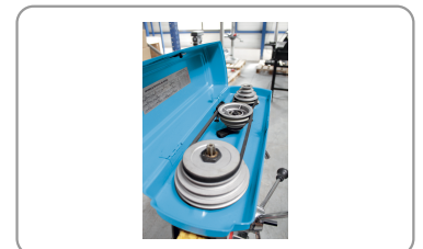
Poulies en acier