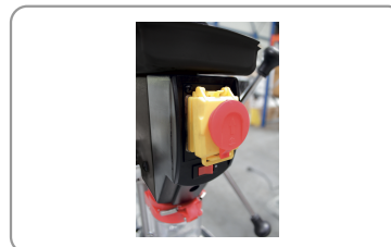
Emergency stop push-button