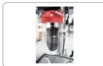
Adjustable chuck guard