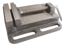
Vice with 100 mm jaws