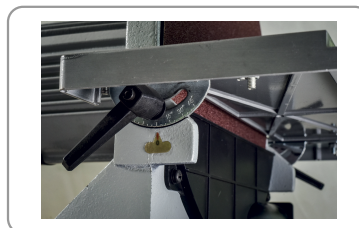
Cast iron table tilting at 45°