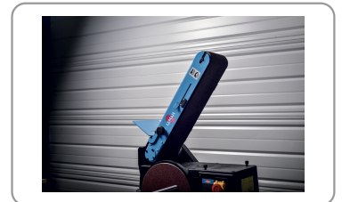
Bande orientable de 0° à 90°