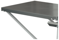
Right extension table