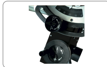
Tilting table at 45°