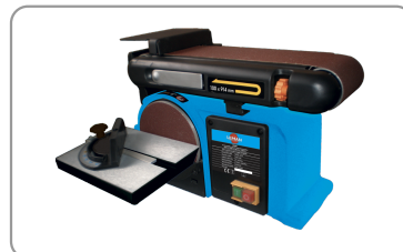
Cast aluminium table tilting at 45°