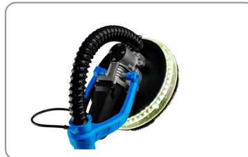
Led lighting on sanding head