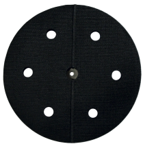
Velcro sanding plate Ø 215 mm