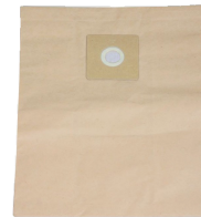
Washable hepa cartridge filter (class L)