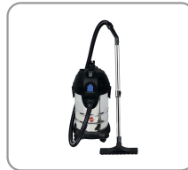
Prise de synchronisation pour machine électroportative maxi 1800w