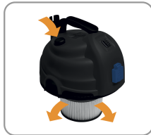
Manual unclogging of the filter by push & clean function