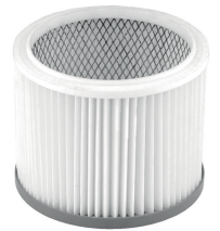
Round brush Ø 60 mm