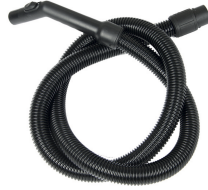
Mixed dust and liquid nozzle 300 mm