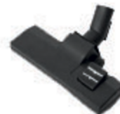
Pvc dust and liquid nozzle