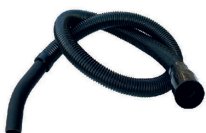
Suction hose 1,5 m