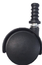
Castor wheel (1 unit)