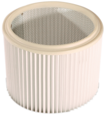
Washable HEPA cartridge filter