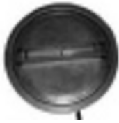
HEPA bottom cap