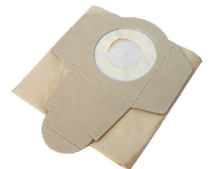
Paper bag filter 30 L (5 units)