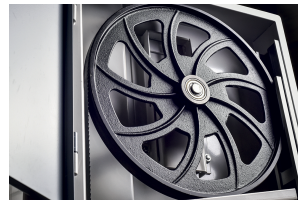
Balanced cast iron flywheels