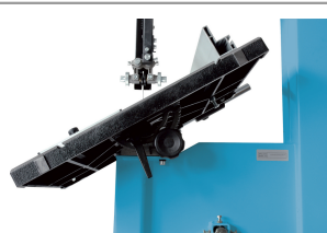
Table tilting at 45°