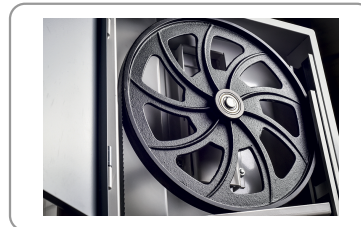
Balanced cast iron flywheels