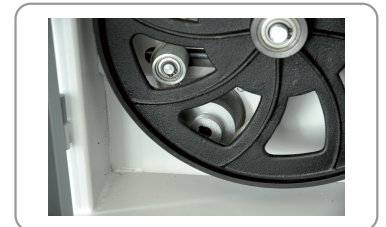
2 vitesses de coupe, pour bois et métaux non-ferreux