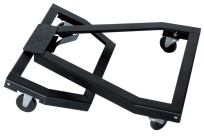
Mobile wheel kit