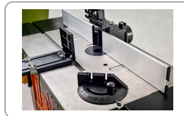
Cast iron table