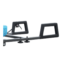
Poignées avec revêtement grip