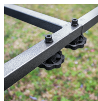
Stand dismountable without tools