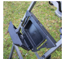
Boitier de rangement des accessoires