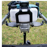
Pivots mounted motor