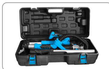
Livré avec une mallette de rangement