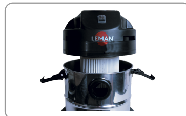
Washable hepa cartridge filter