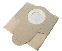
Paper bag filter 20 L (5 units)